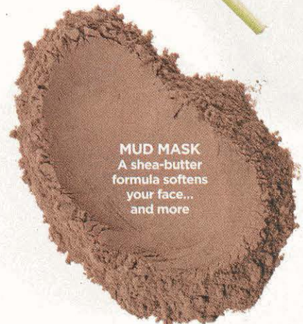
MUD MASK A shea-butter formula softens your face... and more