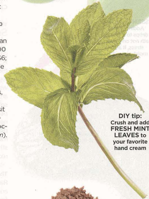
DIY tip: Crush and add FRESH MINT LEAVES to your favorite hand cream