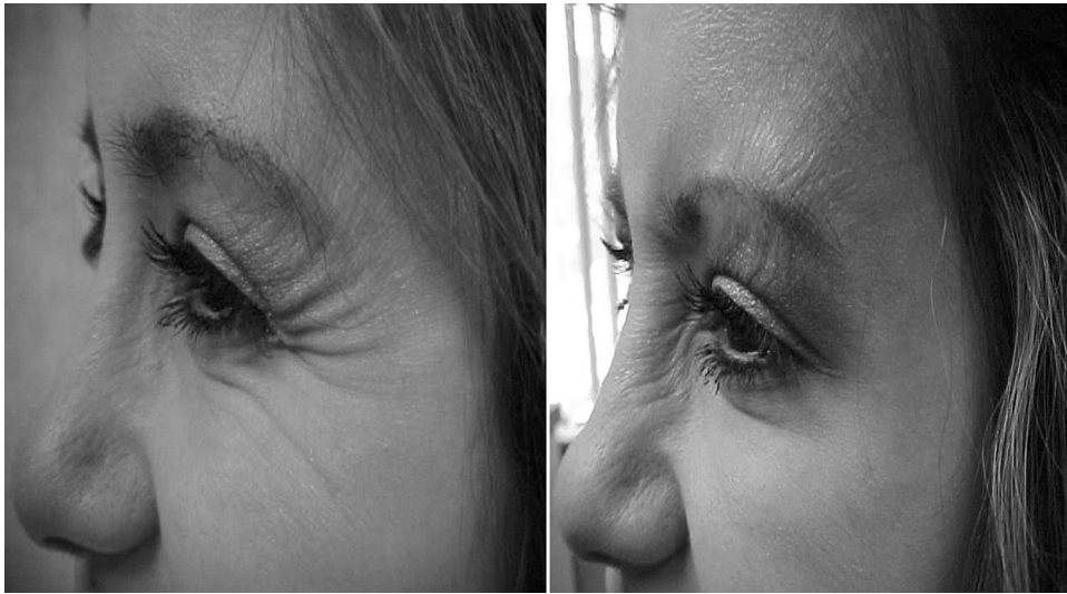
Figure 15.2 Crow's feet photos: 9 U BOTOX® into the crow's feet – four at superior aspect, two mid, two lower and one lateral lower lid.