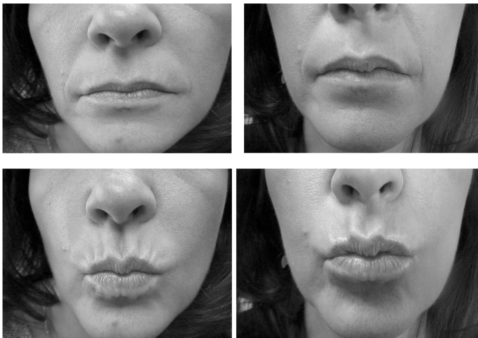
Figure 15.5 Photos on left: pre-treatment, 42-year-old woman, moderate perioral lines with pursing lips, no significant baseline imprinted superficial lines at repose. Photos on right: 14 days post-treatment with 8 U BOTOX ® (10 injection sites, as diagrammed below). Note: post-treatment lips appear fuller, especially with movement – likely a pseudo-augmentation appearance due to upward pull of the remaining superior aspect of the orbicularis oris from the levator labii superioris aleque nasi and zygomaticus insertions. In addition, there is preservation of Cupid's bow symmetry as midline philtrum is maintained.

complain that lipstick 'bleeds' into these lines and any improvement is greatly welcomed by patients.