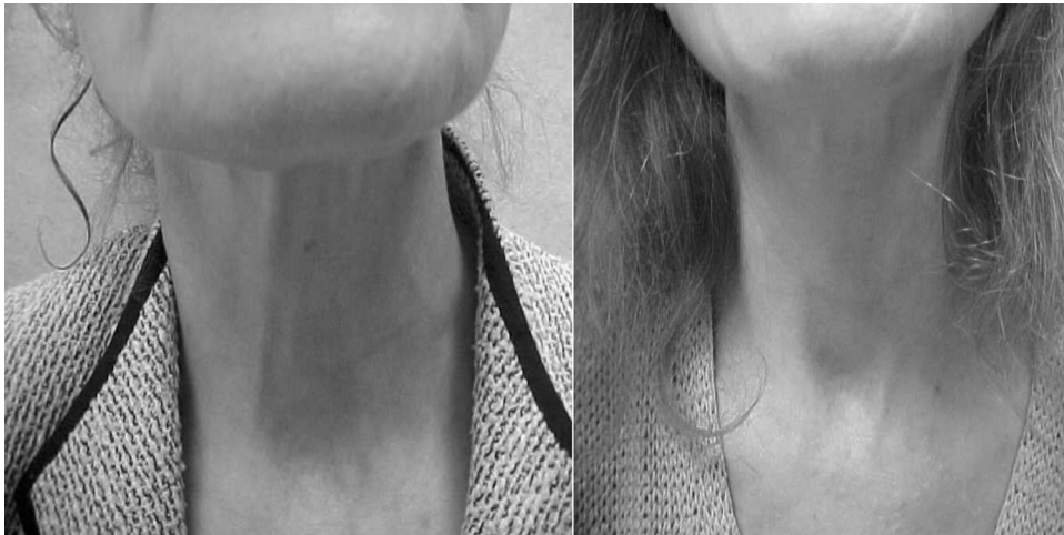
Figure 15.7 A 56-year-old woman was treated with a total of 18 U BOTOX® for vertical neck bands present at rest. The right band was treated with 12 U and the left band 6 U.

Au: Please provide citation for figure 15.7.