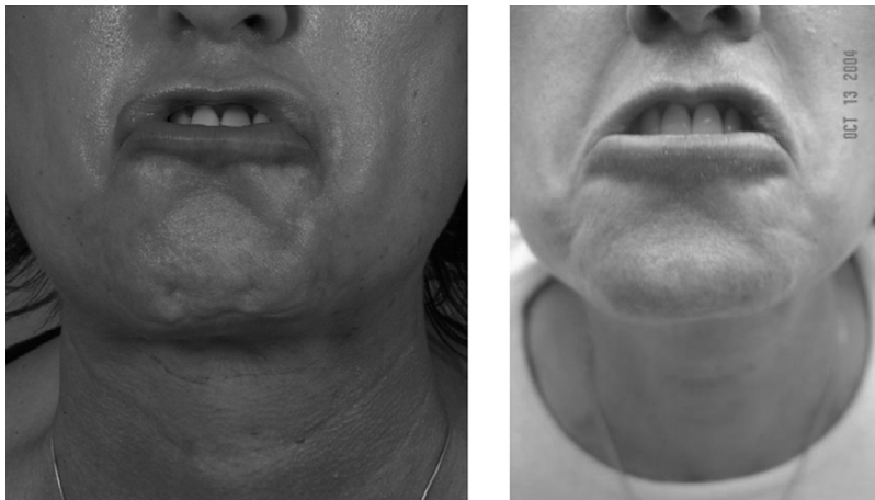
Figure 15.6 A 52-year-old woman who complained of dimpling in her chin when speaking and chewing gum. She was treated with two three-unit injections of BOTOX® into the mentalis (in addition, her horizontal neck bands were treated the same day with a total of 10 U BOTOX®).

After weight loss, chin/neck liposuction or general ageing changes, some patients complain of prominent vertical bands in their neck. These hyperfunctional platysmal bands differ from horizontal lines, which are believed to be from prominent SMAS. The platysmal bands can be relaxed by experienced botulinum toxin A injectors. The specific injection sites are determined at rest, and